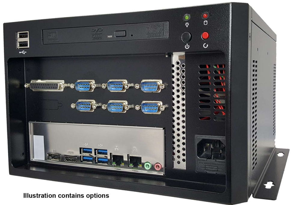
Illustration contains options